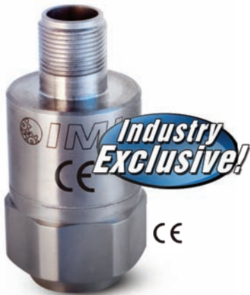
Bearing Fault Detector PLUS Model 649A03

The 649A03 Bearing Fault Detector PLUS is a USB Programmable loop powered device with 4-20mA output, all contained in typical vibration sensor housing. It is specifically designed to provide early warning of typical ball/rolling element bearing faults such as cracked races, spalling, brinelling, and looseness. The model is similar to IMI's 682B05 DIN rail mounted Bearing Fault Detector; however, it is not a direct substitute. Like the 682B05, it provides a 4-20 mA output specially tuned to detect high frequency bearing faults. Unlike the 682B05, which is mounted in a box connected to an external sensor, the 649A03 has a sensor form factor that can directly mount to the machinery. It differs in that it provides several additional outputs, but can only provide one at any given time. These specialized outputs can be selected using the USB Programming function of the transmitter.