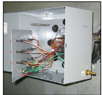
Iris Power Stator Slot Coupler, Iris Power TGA-S and Iris Power TurboGuardII are trademarks of Qualitrol-Iris Power.

QUALITROL-IRIS POWER HAS BEEN THE WORLD LEADER IN MOTOR AND GENERATOR WINDING DIAGNOSTICS SINCE 1990, PROVIDING A FULL LINE OF ON-LINE AND OFF-LINE TOOLS, AS WELL AS COMMISSIONING AND CONSULTING SERVICES.